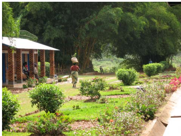
Outside the Rwesero Health Center in Gicumbi District

For example, clinic staff at the Rwesero Health Center in Gicumbi District quickly recognized the potential reward and as a result