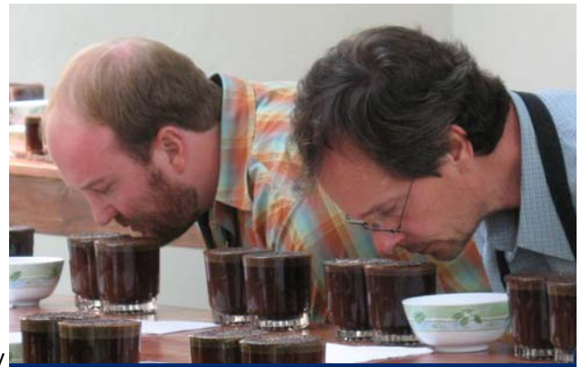
International judges cupped (tasted) coffees during the Golden Cup

"Black Apron Exclusive" by Starbucks and praised as the "best of the best" by Green Mountain Coffee.