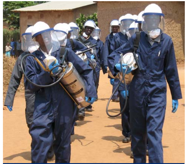
Spray operators during the IRS launch in Gasabo District on August 10, 2007

IRS complements other malaria prevention interventions included in the PMI. In addition to the spraying of homes with insecticide, the PMI purchases and distributes insecticide-treated bed nets for prevention, prevents malaria in pregnant