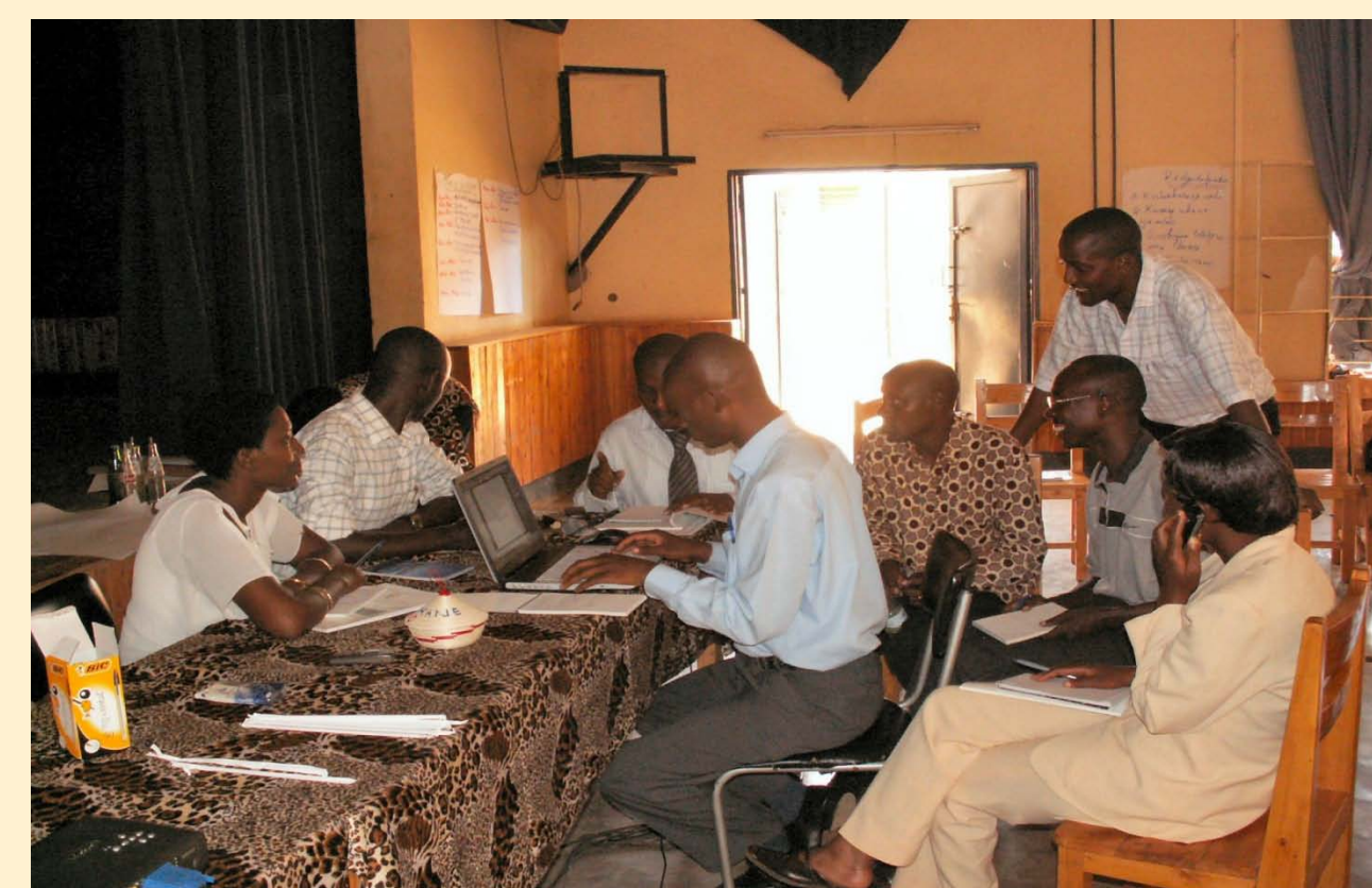
Tax collection data entry