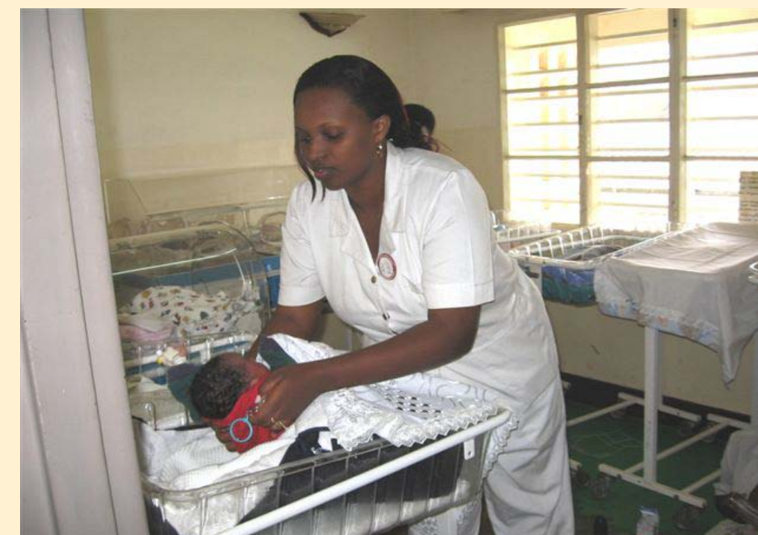
Muhima Hospital benefited from equipment purchased through the DIF grant