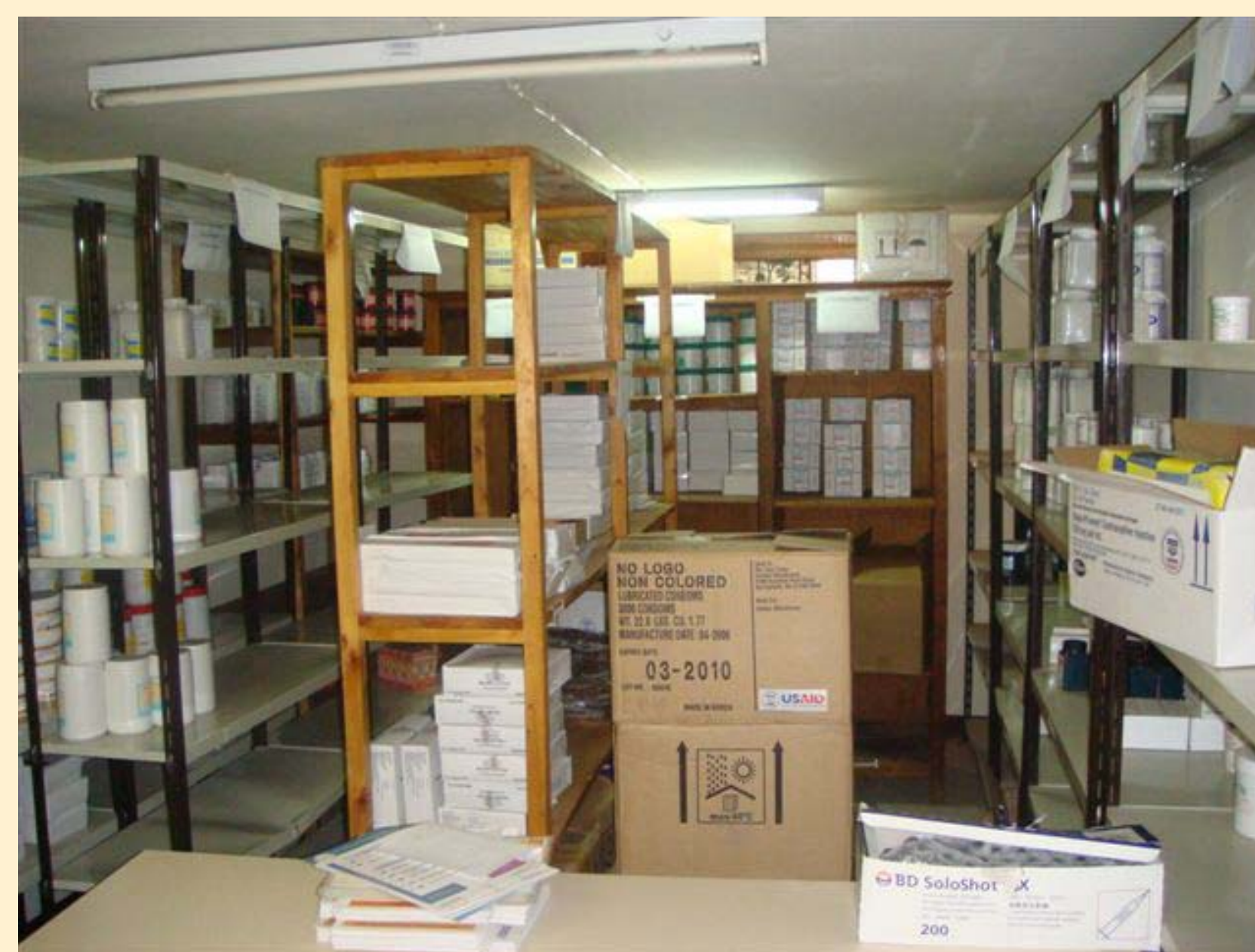
District pharmacy, supported by 2006 DIF grant