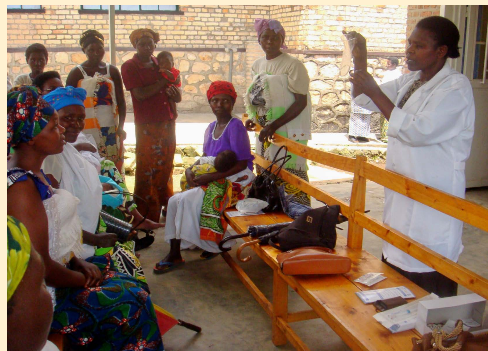
Health Care Providers Make the Difference