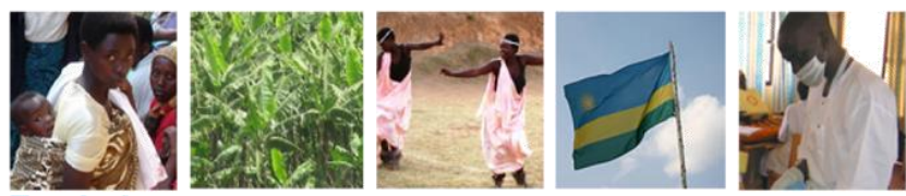
Twubakane Decentralization and Health Program