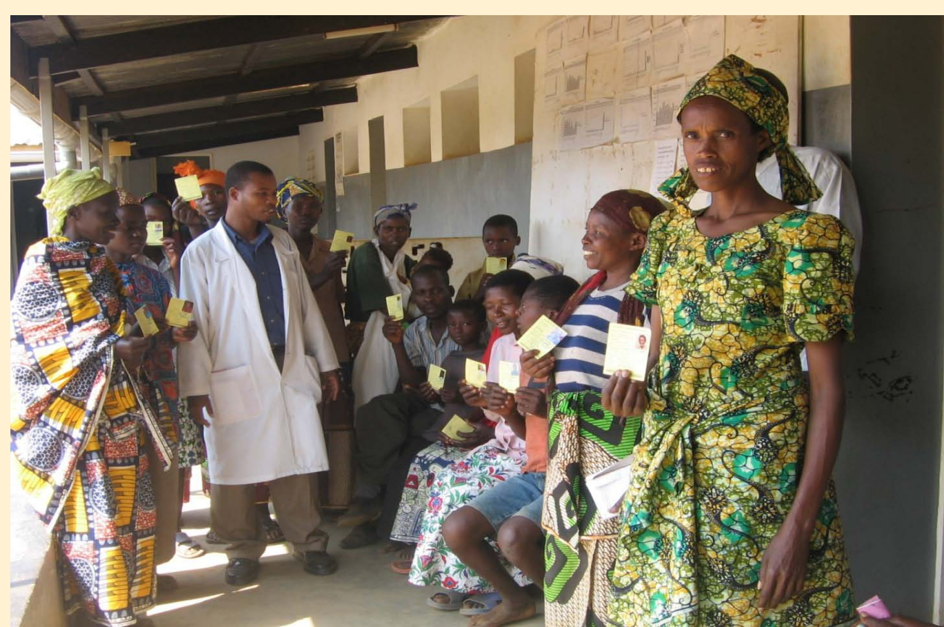
Gahanga Health Center—a mutuelle success story