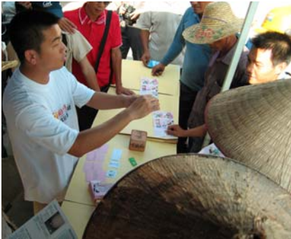
An outreach worker in Guangxi Province, China, teaches dock workers about HIV/AIDS and other sexually transmitted diseases. USAID is working throughout Asia to reduce the incidence of HIV/AIDS and mitigate its impact on infected people and their families.