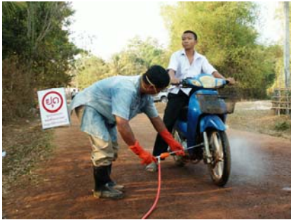
A health worker disinfects a motorcycle at a checkpoint during an avian influenza simulation exercise in Savanaket. The USAID-funded exercise is one of several held in Laos to prepare health workers for outbreaks and educate local residents about the procedures needed to contain the disease.