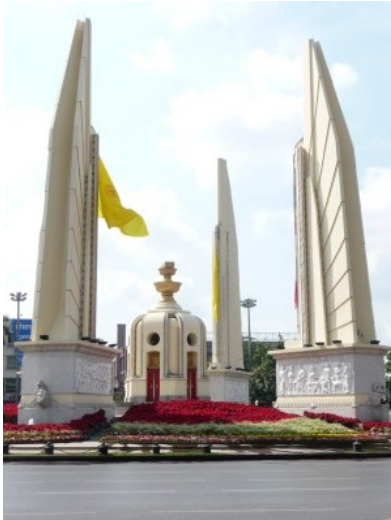
The Democracy Monument in Bangkok.