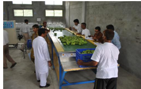
A mango processing plant installed by USAID's Firms project