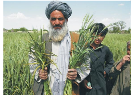
Farmers in Balochistan receive high-quality seeds and fertilizers from USAID