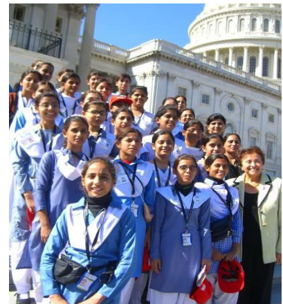
Pakistani students visit Washington through the Link to Learning project