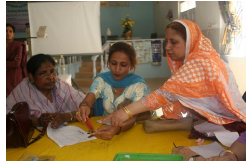
Teachers practice a science exercise as part of the Teacher Education project

USAID is helping improve teacher education programs by institutionalizing pre-service teacher education and training. USAID is strengthening teacher training curricula and institutions to help teachers meet new accreditation standards.