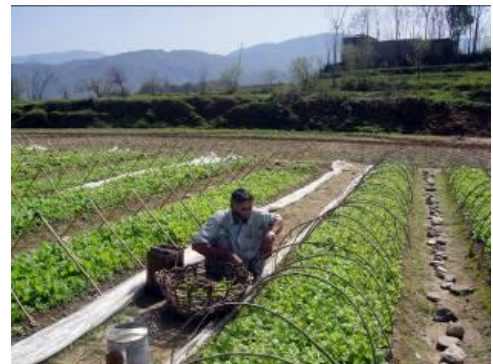
A farmer in FATA supported by USAID