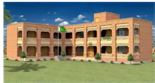
An architect's view of a USAID-supported government school in Malakand

USAID is supporting vulnerable children affected by extremism in the region. The program has established 30 child protection centers in Malakand and is providing support for psychological counseling and the reintegration of students.