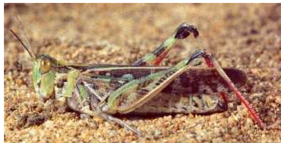
(Australian plague locust)

significant population increase in 2011 (APLC)