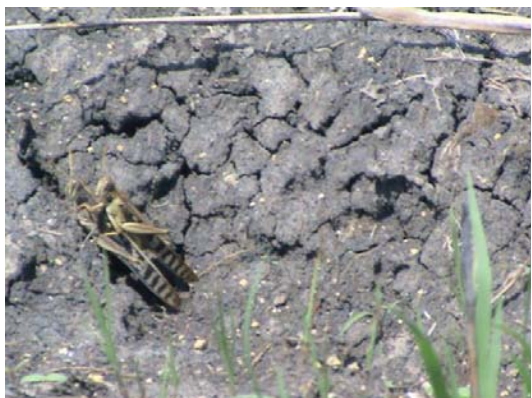
Adult NSE mating/laying eggs in Ikuu plains, Tanzania; 4th December, 2010 (IRLCO-CSA)

GreenMuscle will be used in ecologically sensitive areas. Active surveillance and monitoring are essential particularly in areas North Rukwa plains, Wembere and Ikuu-Katavi with main focus on areas closer to crop fields (IRLCO-CSA).