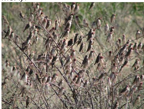
(A QQU roost, a file photo; free encyclopedia)

In Tanzania, flocks of QQU populations were detected around Kapunga rice seed farm in Mbarali district in Mbeya region. Although the pest has not caused any damage yet, MoA is mobilizing resources to prevent any threats it poses to the crop (ITLCO-CSA, MoA).