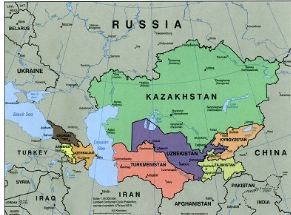
(Locust prone CA countries, FAO)

compiled and no locust activities are expected in the region during this time.