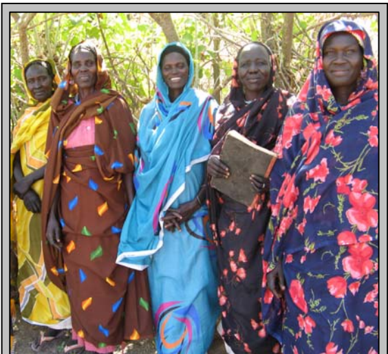
Women work together to plant vegetable gardens to improve food security in Southern Kordofan State (Photo by Tiaré Cross, USAID).

Since FY 2004, USAID/OFDA has provided more than $576 million to meet the immediate humanitarian needs of approximately 4.7 million vulnerable individuals in Darfur. While continuing to provide crucial emergency assistance, USAID/OFDA has also begun to address sustainability of emergency programs and recovery challenges.