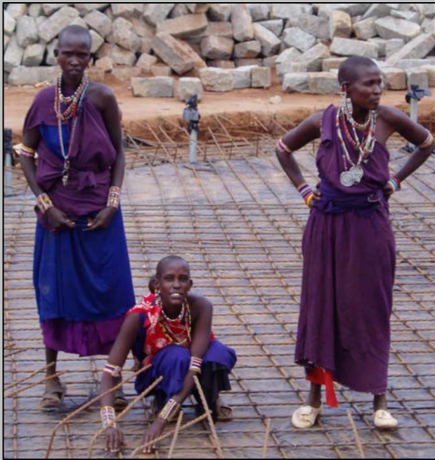
Local residents construct a water storage tank as part of a USAID/OFDA-funded disaster risk reduction program designed to increase access to safe drinking water in Kenya.

In response to the post-election violence in late 2007, USAID/OFDA deployed a Disaster Assistance Response Team (DART) to Kenya, followed by the activation of a Washington, D.C.-based Response Management Team in June 2008. In addition, USAID/OFDA deployed a second DART in September 2008 as part of a regional response to increased food insecurity in the Horn of Africa.