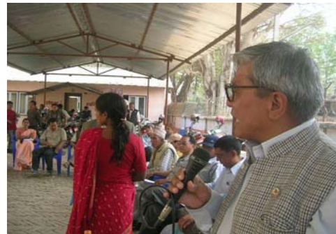
A CA member responds to questions from residents of Makwanpur during a live radio program.

Linking CA Members and Constituents through Radio – OTI provided extensive support to 36 FM radio stations throughout the country, assisting them with efforts to produce and air live radio talk shows that connected CA representatives and local government officials to their constituents. The program supplied many of these stations with equipment that enabled them to conduct local discussion forums with live connections to concerned decision makers, including CA representatives and chiefs of district government offices. These programs allowed rural communities to provide feedback on constitutional topics to the CA members and also provided a forum for the CA members to deliver messages to their constituents. In many areas, these dialogues provided the only platform where an ordinary citizen could have direct access to these officials. During the programs, officials were able to clarify misunderstandings about various state processes, such as land registration. In addition, officials were able to hear points of view that they may not have otherwise heard. The forums significantly enhanced local dialogue, as officials recognized that citizens were watching and citizens saw that officials would listen.