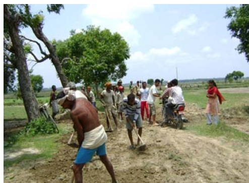
The YMC in Durgapur worked with the community to repair a village road.

Mobilizing Youth for Small-Scale Development Activities – Youth remain forceful actors in the transition process, particularly at the local level, and OTI has devoted significant resources to activities targeting young people. The program supported local nongovernmental partners with efforts to establish Youth Mobilization Committees (YMCs) in hundreds of villages across 11 eastern and central Terai districts, areas where youth are recruited by armed groups. Through the YMCs, which were inclusive of women and participants from historically marginalized groups, youth consulted with community leaders to identify small-scale development projects. Then, using an in-kind mechanism and a small grant (less than $400), the YMCs worked with their communities to implement priority projects. Commonly known as community development funds (CDFs), these activities engaged more than 120,000 young people in productive community improvement projects during an 8-month period. Projects included reconstruction of community libraries and early childhood development centers as well as rehabilitation of roads, health posts, and schools, and community-generated funding nearly matched the CDF grant funding provided by OTI.