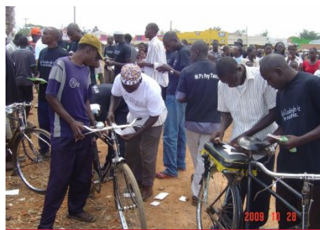
Boda boda operators in Kisumu put stickers calling for equitable taxation on their bikes.

Fighting Impunity and Unfair Taxation – Two OTI grants, Marshalling People’s Power and End Impunity—Pay Tax, had a secondary impact in Kisumu. When the municipal council levied a tax on boda bodas (bicycle taxis), operators poured into the streets by the thousands to protest. The drivers chanted: “No Reforms, No Taxation.” The protesters stated that they would pay the tax only if total reforms, including reforms to institutions like the council, are implemented to ensure that the taxes are used properly for community benefit. They also said that they would not pay taxes unless MPs take a leading role and pay their taxes. The Kisumu Council immediately suspended the policy while it consulted on the matter. For the drivers, it was an empowering success: No stone was thrown and no tear gas was fired.