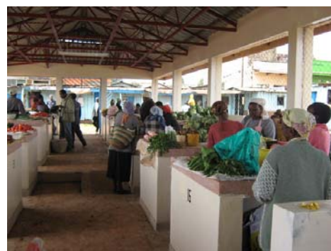
The renovated Burnt Forest Market is again open for business.

Burnt Forest Market Reopens – Burnt Forest was a locus of extreme violence in late 2007 and early 2008. The main marketplace was destroyed and largely abandoned because of lingering animosities between the town’s two primary ethnic groups. Following the violence, the groups set up markets in separate areas. Support from OTI allowed the Rural Women’s Peace Link (RWPL) to conduct community dialogue and reconciliation meetings, where it was agreed that the central market should be rebuilt. Subsequently, the Burnt Forest Town Council signed an agreement to manage the market in partnership with the RWPL. For one year, the parties are operating the market with a focus on promoting reconciliation and implementing peace activities. The council will take full responsibility for the market’s operations after the first year. The inhabitants of Burnt Forest are now patronizing a marketplace that they see as a symbol of hope and that marks a new beginning for the entire community.