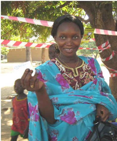
A voter in Juba, southern Sudan, displays her voter registration card for the April 2010 national elections.