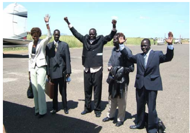
Sudanese doctors who had been living in Canada arrived in Juba in October 2006.

As a result, Southern Sudan has some of the worst health indicators in the world. One out of four children dies before turning five years old, and more than