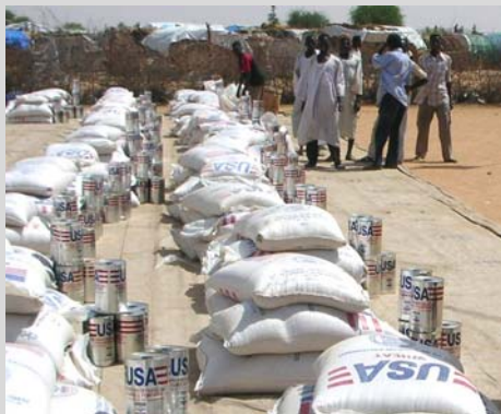
Food distribution in Kalma camp, South Darfur.

USAID is the leading donor of food assistance to Sudan. Since October 1, 2006, USAID has provided 391,900 metric tons of emergency food aid worth more than $393 million to Sudan and Sudanese refugees in Eastern Chad. Approximately 75 percent of this total goes toward feeding displaced people and refugees in Darfur and Eastern Chad, where conflict continues to disrupt food security. The remaining 25 percent is allocated to people in Southern Sudan, Eastern Sudan, Abyei, Blue Nile, and Southern Kordofan, where food aid continues to play a vital role in supporting returnees to Southern Sudan and helping communities recover from two decades of civil conflict.