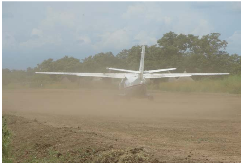
An NPA plane takes off from Pagak to deliver food and supplies to flood-affected communities.

The Three Areas are Abyei, Blue Nile, and Southern Kordofan.