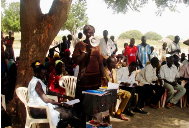
The chairwoman of the Leer Forum speaks to members of the coalition.

coalitions now advocate for issues ranging from girls education to land distribution for returnees.