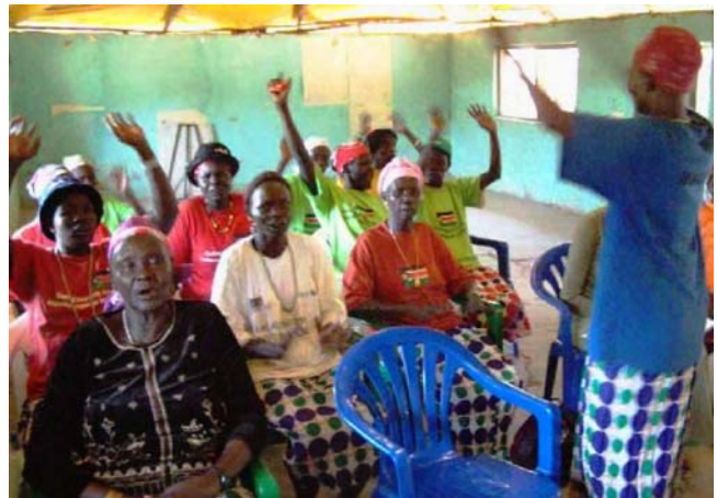
In Rumbek, women sing during a community dialogue on land laws.

While participants expressed apprehension about the potential for land conflict and fear about the lack of