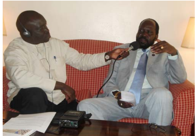
A journalist from the Sudan Radio Service interviews Salva Kiir, the president of the Government of Southern Sudan.