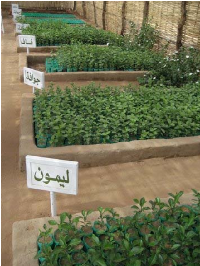
A nursery in Otash camp provides fruit tree seedlings for rural communities.

Each of the centers has played an important role in the transfer of agricultural technology to rural areas and serve as demonstration plots for improved practices. Administration of 13 of the centers has been handed over to their local county agriculture departments, reflecting the areas that have attained a reasonable level of food security. However, because of the large number of returnees expected from camps in Uganda and Central Equatoria, USAID plans to continue to support the Kenyi center.