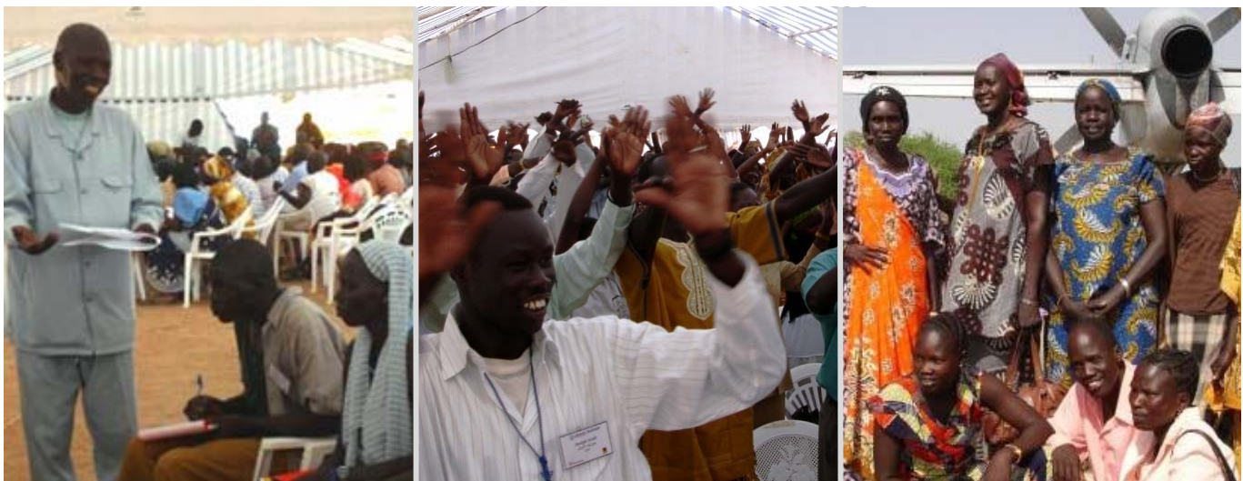
Organizations from Southern Sudan and the Three Areas gathered for a conference in Malual Kon.