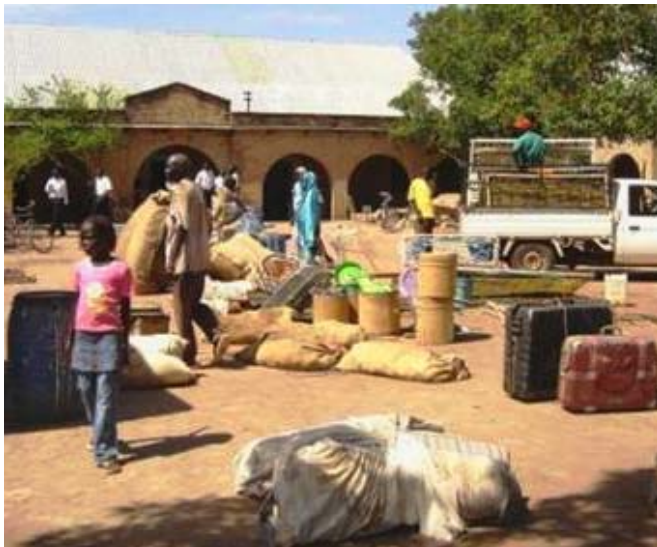
In Rumbek, 151 returnees from Khartoum and Ethiopia collected UN assistance packages before traveling onward to their home villages.

refugees who had flown in from Gambela, Ethiopia, and the 151 rode on to Rumbek. Before traveling onward to their places of origin, the returnees received an assistance package from a group of international agencies, including food rations from the UN World Food Program, seeds and tools from the UN Food and Agriculture Organization, and relief commodities from the UN Children's Fund.