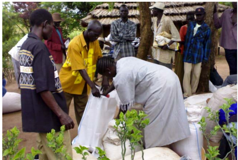
Residents of Lainya County collect seeds and tools that will help increase agricultural yields.

The Three Areas are Abyei, Blue Nile, and Southern Kordofan.