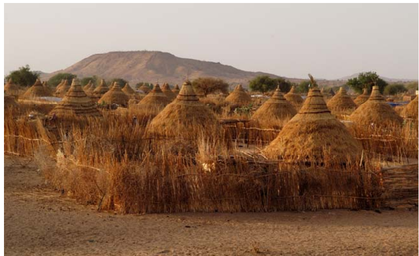
With support from USAID, CRS works with displaced people in West Darfur to plan and construct shelters.

The Three Areas are Abyei, Blue Nile, and Southern Kordofan.