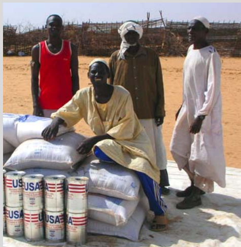
Food distribution, Kalma camp.

USAID is the world's leading donor of food assistance to Sudan. Since October 1, 2006, USAID has provided 388,020 metric tons of emergency food aid worth more than $389 million to Sudan and Eastern Chad. Approximately 75 percent of this total goes toward feeding displaced people and refugees in Darfur and Eastern Chad, where conflict continues to disrupt food security. The remaining 25 percent is allocated to people in Southern Sudan, Eastern Sudan, Abyei, Blue Nile, and Southern Kordofan, where food aid continues to play a vital role in supporting returnees to Southern Sudan and helping communities recover from two decades of civil conflict.