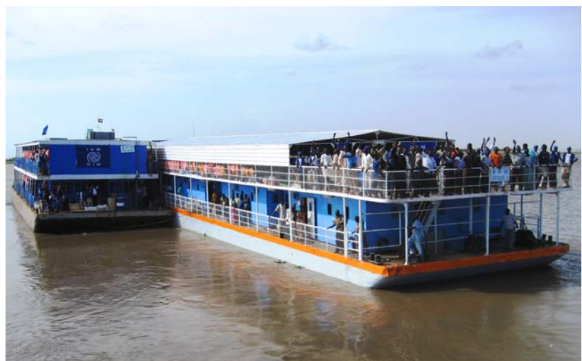
Southern Sudanese board barges at Kosti that will take them to Jonglei and Lakes states.

The Three Areas are Abyei, Blue Nile, and Southern Kordofan.