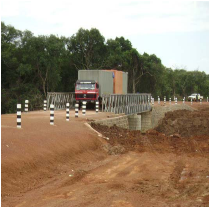
The refurbished Bandame Bridge, on the Yei-Maridi Road in Central Equatoria state.

The bridge, on the Yei-Maridi Road, collapsed three times during the rainy season in 2007, cutting off thousands of vulnerable people’s access to important goods and services. It has been rebuilt as part of the Sudan Accelerated Infrastructure Program, a partnership between USAID and the Government of Southern Sudan. The program provides employment opportunities to displaced, returning and other disadvantaged people in the region. It also facilitates the return and reintegration of people affected by the country’s two-decade civil war, which ended in 2005.