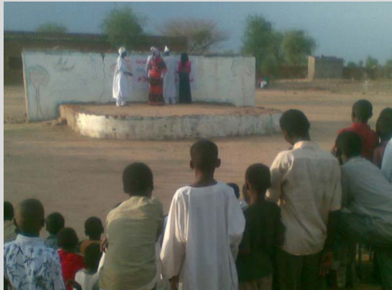
At a makeshift theater in South Darfur, actors set the stage for a discussion with their audience on peaceful conflict resolution.

Local radio broadcast several of the performances and, equipped with props and costumes, each troupe planned to stage four more productions in the near future. ♦