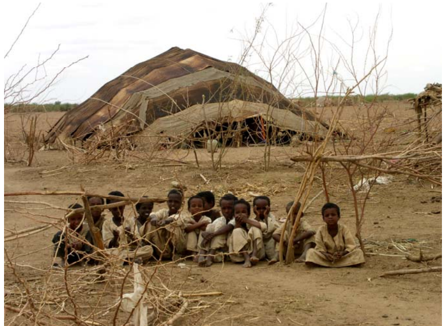
Beja children in Kassala state, Eastern Sudan.

* Funds managed jointly with U.S. Department of State