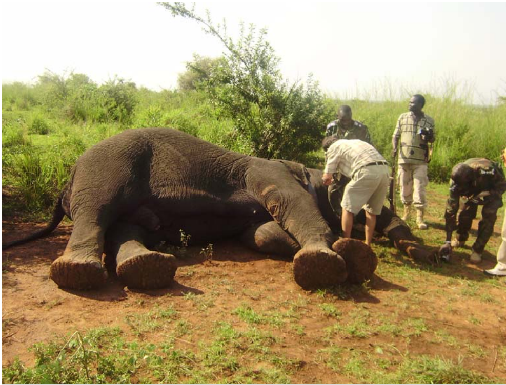
Staff of the Wildlife Conservation Society (WCS) and Southern Sudan's Ministry of Wildlife Conservation and Tourism collar an adult male elephant with a GPS satellite tag in Nimule Park.