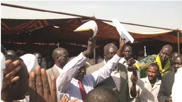
Northern Bahr el Ghazal Governor Paul Malong displays to a crowd gathered in Aweil the joint communiqué on community security issued in January by the Dinka Malual and Rezeigat.

escalating cycle of conflict. Although the Comprehensive Peace Agreement, signed in 2005, officially put an end to fighting between the Government of Sudan and the Sudan People's Liberation Movement, regional clashes continued—driven largely by a scarcity of water for cattle herds, easy access to small arms, and lack of government mediation between the two sides.