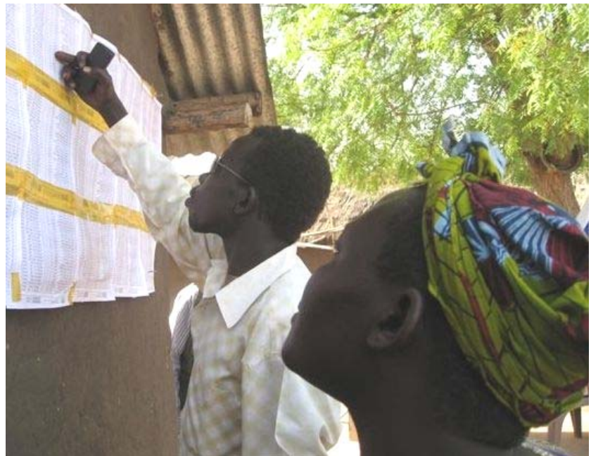
Voters in Juba, Sudan, look for their names on a list of registered voters at a polling station during Sudan's first multiparty elections in 24 years.

USAID supported key areas of the electoral process—technical and material support for election administration, including training of registration and polling staff and supply of polling materials; civic participation, including voter education, political party capacity building, media assistance, and support to Sudanese organizations for domestic election observation; international election observation; and census administration prior to the elections.