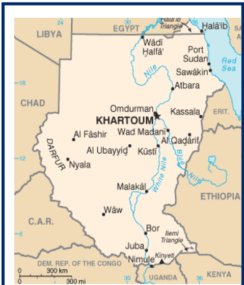
USAID Assistance to Sudan FY 2009

This month, Sudan's first multiparty elections since 1986 fulfilled a major requirement of the 2005 Comprehensive Peace Agreement (CPA) that ended the 22-year, north-south civil war, giving millions of Sudanese the first opportunity in their lives to vote. The election included contests for national, state, and southern Sudan legislatures, state governors, president of Sudan, and president of the regional Government of Southern Sudan (GOSS).