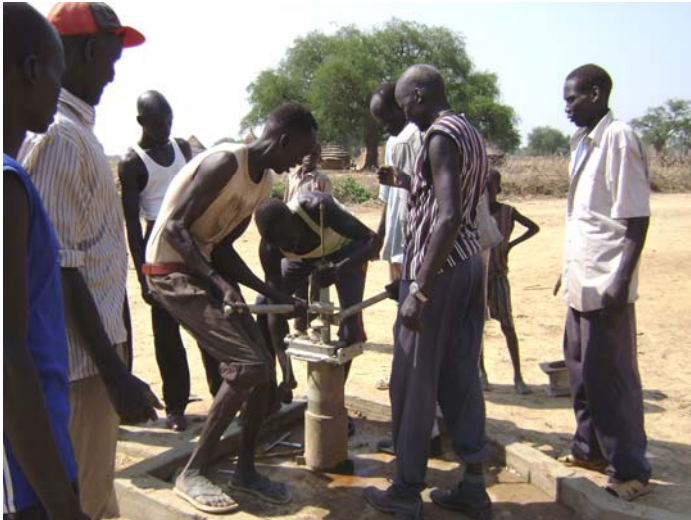
USAID-trained “super technicians” practice hand pump repair that benefits the entire community.

To address the critical need for water, USAID’s Building Responsibility for the Delivery of Government Services (BRIDGE) program is working with communities to construct, rehabilitate, and manage water-supply boreholes. BRIDGE helped establish community-based water user committees to manage the boreholes, and trains “super technicians”—local men and women who learn to repair the water sites. The super technicians are provided with repair kits and extensive training on hand pump repair and maintenance to enable them to respond quickly to problems.