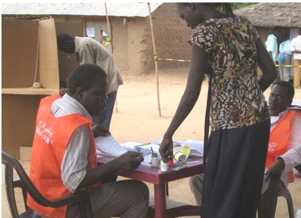
Poll workers at a voting site in Juba, Sudan, assist one voter as another voter (upper left) fills out his ballot.

USAID is also providing technical assistance to other political processes that are mandated by the CPA—the referenda on the future status of southern Sudan and Abyei, scheduled for January 2011, and popular consultations for Southern Kordofan and Blue Nile states. USAID referenda assistance is already prepositioned through existing partners and mechanisms for timely support. Programs will build on activities begun in support of the peace process in 2004. Support will focus on technical assistance for administration of the referenda and popular consultations; civic participation for all citizens to effectively engage in the processes; and domestic and international observation. USAID has been supporting preparations for the popular consultation processes since 2008, including sponsoring study tours to Indonesia and Kenya that offered citizens and officials from Southern Kordofan and Blue Nile states the opportunity to learn about similar processes in other countries. ♦