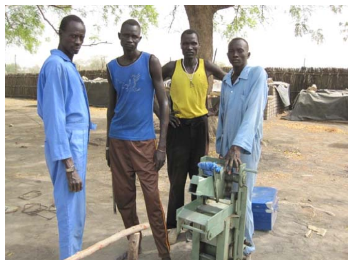
Lou Nuer and Jikany Nuer youth in Jonglei state receive USAID training to use the compressed-soil blockmaking machine.

With support from USAID, 52 youth received training in compressed-soil blockmaking on four newly donated machines. Working together, the youth made 14,000 blocks in just over two weeks. Some of the youth are now employed in a follow-on activity to rehabilitate the Akobo County headquarters office building using blocks made during the training. These youth will also form the nucleus of a for-profit business association USAID will support to engage in construction projects to develop this severely poor area.