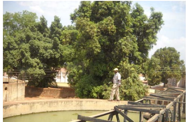
The water treatment plant in Wau, Western Bahr el Ghazal, which USAID will help expand and upgrade in a project to begin this year.

The existing water treatment plant was built in the 1930s and currently serves 500 households. USAID's Sudan Infrastructure Services Project (SISP) will break ground this year on the rehabilitation and expansion of a water treatment plant that benefits 100,000 people in Wau's residential neighborhoods, as well as government offices and private businesses—twice the output of the existing facility.