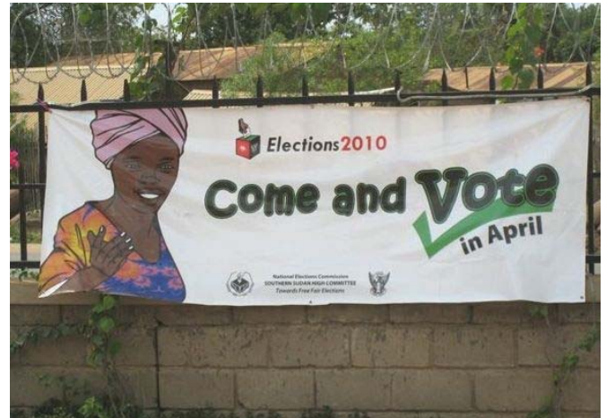
An election poster in Juba, Sudan, encourages voter participation.