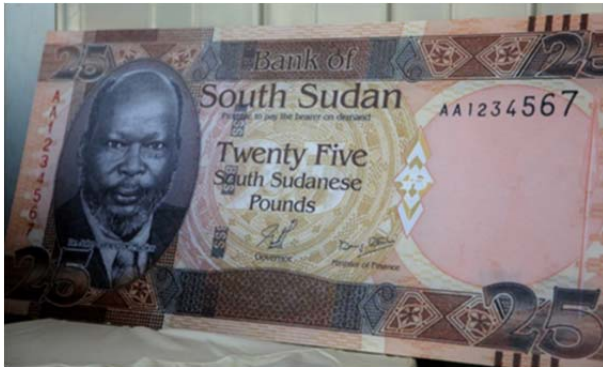
South Sudan's new currency.

On July 28, the Central Bank held its first currency auction of U.S. dollars for the South Sudanese pound—an auction declared by international experts as "successful and transparent."