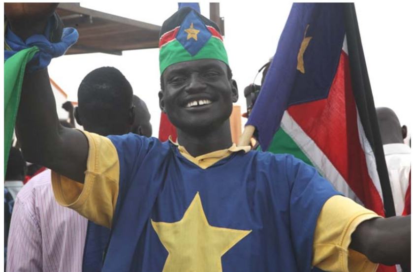
The joy of independence is evident in the broad smile of this South Sudanese.