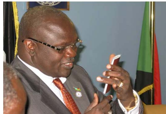
South Sudan Vice President Dr. Riek Machar Teny inspects the first issue of a passport for the new nation of South Sudan.

The change of the fiscal year also affects budget execution. Information will need to be adjusted in the central government and all 10 states, requiring several weeks to complete. These adjustments will separate the pre-independence Government of Southern Sudan financial records from those of the new Republic of South Sudan. ♦