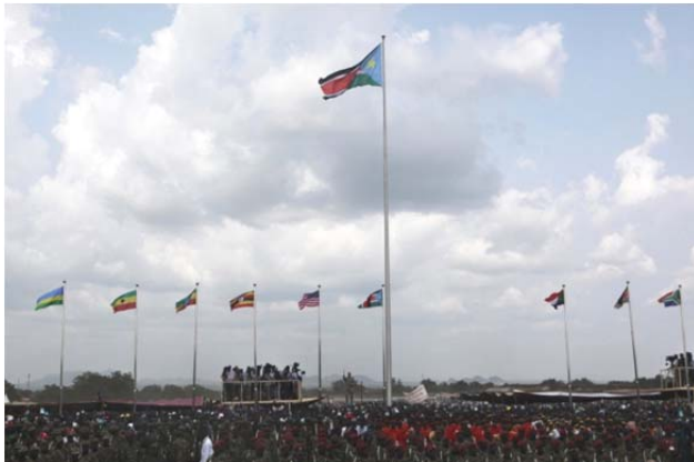
Thousands stand under the newly hoisted Republic of South Sudan flag during independence celebrations in Juba on July 9, 2011.

Government Communication with Citizens: Facing heightened public expectations about government services and economic opportunities following independence, the South Sudan government now must communicate its programs and policies to the population of more than 8 million, which comprises more than 67 ethnic groups spread over an area slightly larger than France. Many do not understand English, the official language, and live in areas without roads, electricity, or radio coverage.