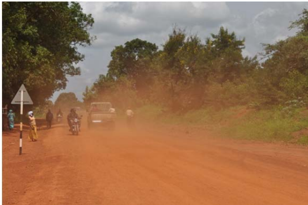
Vehicles, motorbikes, and pedestrians share this road in Western Equatoria that USAID improved to all-weather standard.