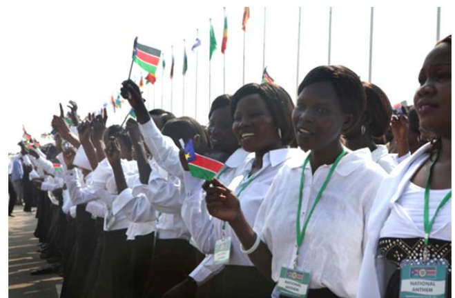
National anthem singers at the Dr. John Garang Memorial site in Juba, South Sudan, celebrating Independence Day on July 9.

The immediate challenge facing South Sudan in marketing for the petroleum sector is the need to build capacity to understand the global marketplace for oil, as well as the day-to-day operational activities necessary to sell oil.