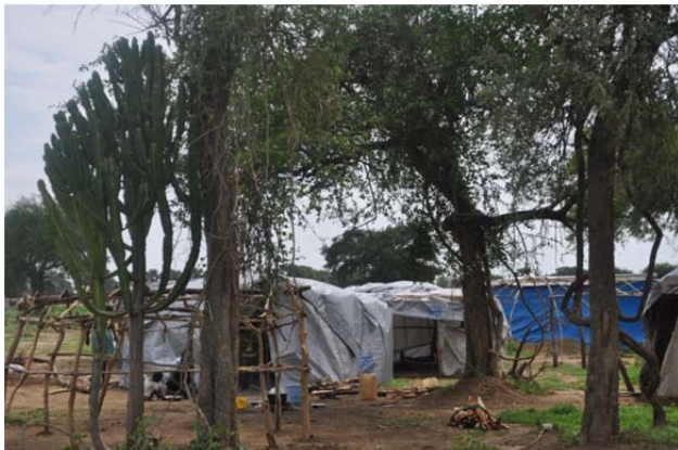
Rains kept displaced Abyei residents from building traditional mud structures and most were living under plastic sheeting.

Food insecurity remains a concern and is attributable to rising food prices due to trade restrictions imposed by the Government of Sudan across the Sudan-South Sudan border and increased pressure on the food supply due to the influx of IDPs. ♦