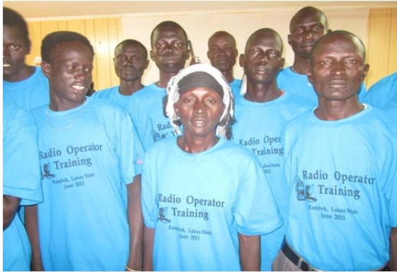
Radio operators trained in Rumbek through a USAID program to help South Sudan prevent conflict.

violence and insecurity. A total of 89 high-frequency radios with solar panels were installed in Northern Bahr el Ghazal, Lakes, Warrap, Unity, Jonglei and Upper Nile states, enabling remote villages and counties to communicate with one another and with their respective state governments.