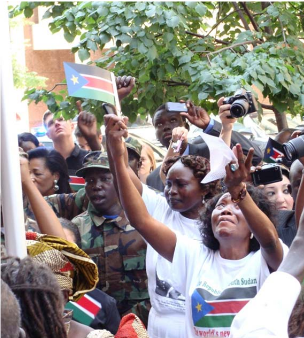
Emotions ran high at the raising of the South Sudan flag in Washington on July 9 as the Government of Southern Sudan Mission to the United States officially became the South Sudan Embassy.