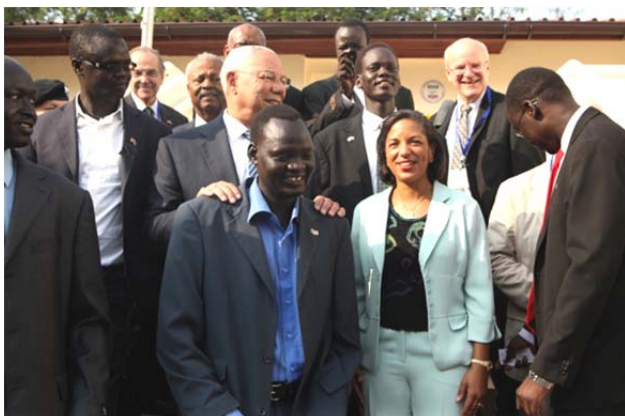
South Sudanese-American former refugee "Lost Boys" with the U.S. delegation to the South Sudan independence ceremony. U.S. Ambassador to the United Nations Susan Rice (front) led the delegation, which included U.S. Special Envoy to Sudan Princeton Lyman, U.S. Representative Donald Payne of New Jersey, former Secretary of State Colin Powell, who witnessed the signing of the Comprehensive Peace Agreement in 2005, and USAID Deputy Administrator Donald Steinberg (at upper right).

Government Communication with Citizens: Facing heightened public expectations about government services and economic opportunities following independence, the South Sudan government now must communicate its programs and policies to the population of more than 8 million, which comprises more than 67 ethnic groups spread over an area slightly larger than France. Many do not understand English, the official language, and live in areas without roads, electricity, or radio coverage.