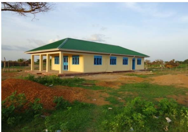
The new Peace Center in Warawar, Northern Bahr el Ghazal, completed with USAID assistance to promote local peace efforts.

On August 13, USAID took part in the opening of a new Peace Center in Warawar, Northern Bahr el Ghazal state, designed to promote dialogue on inter-ethnic violence between the Dinka Malual of Northern Bahr el Ghazal and nomadic Misseriya and Rezeigat tribes from Southern Kordofan and South Darfur. USAID started implementing conflict mitigation and stabilization activities in Warawar in February 2011 to reduce conflict in the border areas of Northern Bahr el Ghazal.