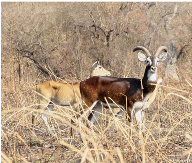
The white-eared kob in South Sudan.

As a new nation, the Republic of South Sudan has a unique window of opportunity to address the root causes of many of the threats to land, security,