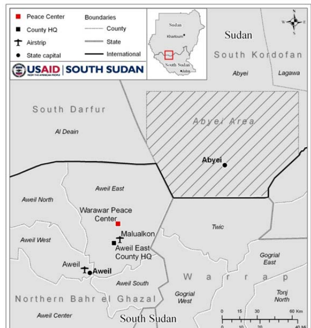
Location of the new Warawar Peace Center

Working with the Northern Bahr el Ghazal State Ministry of Peace and Comprehensive Peace Agreement Implementation, USAID supported the construction, furnishing, and equipping of the Warawar Peace Center and helped to build the capacity of the Warawar Peace Committee to address inter-ethnic violence.