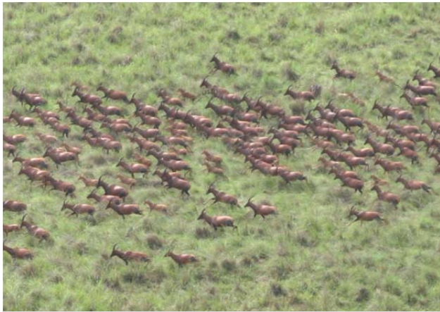
Tiang migration in Badingilo National Park, South Sudan.

Despite experiencing decades of civil war, South Sudan is home to one of the largest wildlife migrations in the world, a rich variety of wildlife species, one of the largest untouched savanna and woodland ecosystems remaining in Africa, tropical forests, and the Sudd, the largest wetland in Africa. The land and natural resources are of vital importance to local livelihoods and for the development of the new nation of South Sudan.