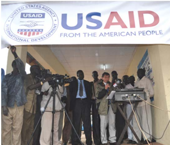
U.S. Chargé d'Affaires Ambassador R. Barrie Walkley (with microphone) participates in the opening of the USAID-funded Peace Center in Warwar, Aweil East County, Northern Bahr el Ghazal State.

and Blue Nile) access to essential food and household commodities. They also facilitated nomadic grazing agreements between warring sides. During and after the war, the committee promoted communication and reconciliation across political and ethnic divides.