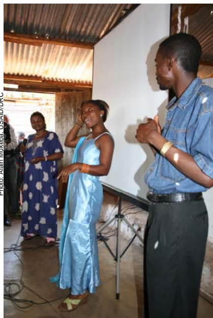
A Deaf expresses her point of view through sign language during a debate following the film