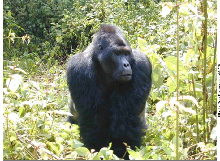
An eastern lowland gorilla

The forests of Itombwe are recognized by conservationists as an important center