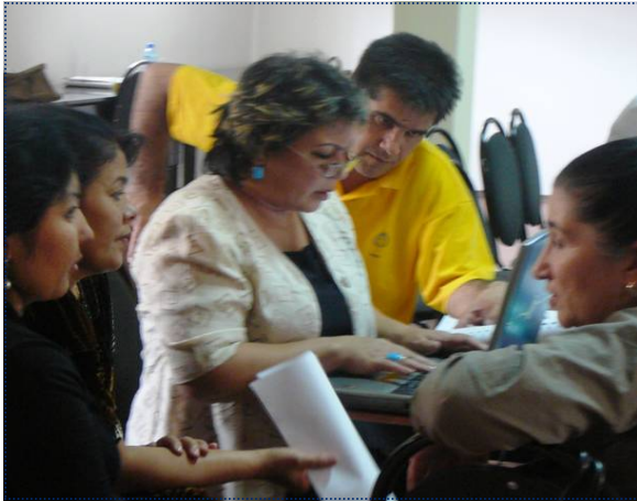
Clinical practice guidelines working group

main reference materials referred to in the family planning pre-service curriculum developed by the Regional Activity and disseminated throughout the region.