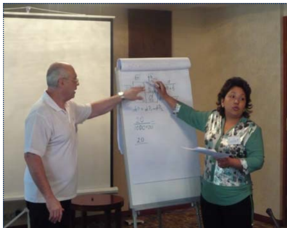
Presenters give a skills-building workshop on evidence-based medicine in Kyrgyzstan.

After the Academic Consultation, Regional Activity actions were designed to directly address the barriers noted above. The initiative was met with great enthusiasm, and as a result teams from several countries—Georgia, Kyrgyzstan and Russia—supported the improvement of family planning pre-service education in medical and nursing schools in their countries. Pre-service activities consisted of a series of skill- and capacity-building workshops for medical faculty that included “Family Clinical Training”, “Evidence-Based Medicine”, and curriculum des design “Curriculum Design”. 8