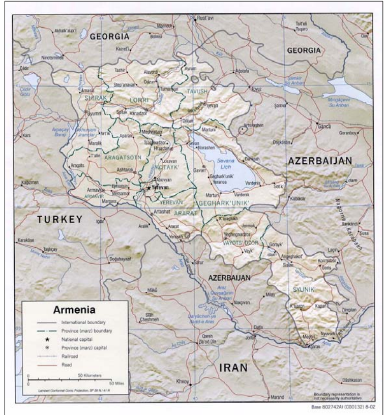
Figure 1: Map of Armenia

Armenia is administratively divided into eleven regions including the capital city of Yerevan. These regions are called “marzes” (or “marz” in singular) and are headed by regional governors appointed by the President. Armenia is a sovereign, democratic state with an Executive, Legislative, and Judicial branch. The heads of Ministries are appointed by the Prime Minister and each Ministry has several deputy ministers. At the marz level there are regional department heads leading, for example, the Department of Health and Social Affairs.