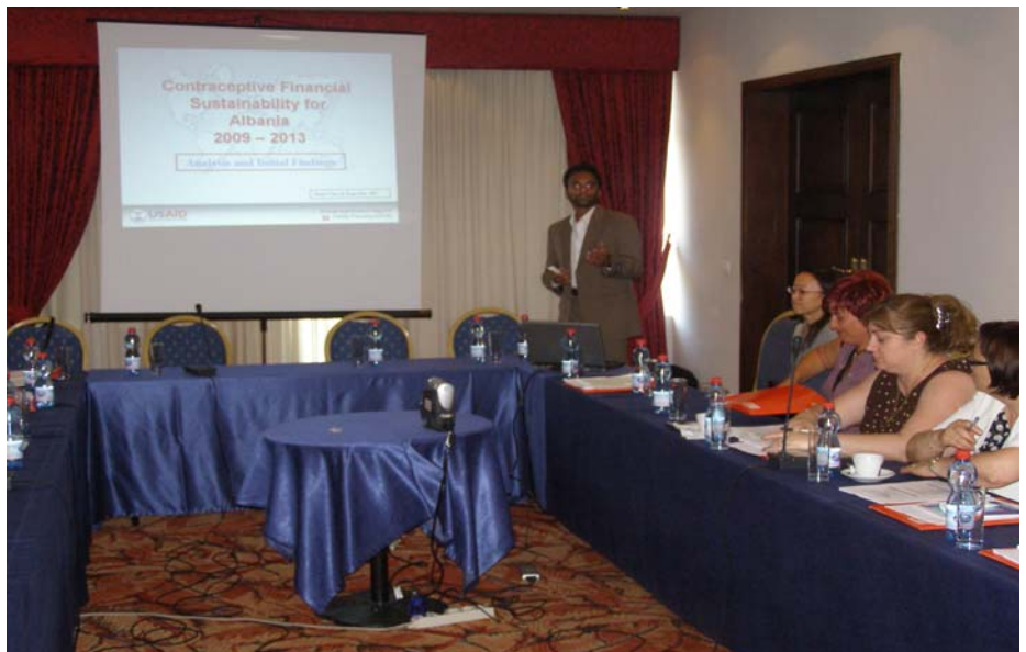
Presentations of Contraceptives Financial Sustainability Study to the RH committee

Moreover, at the request of the Contraceptive Security Technical Working Group (CSTWG), we developed a financial sustainability implementation plan. The intent of the implementation plan was to provide the CSTWG with an initial guidance on suggested action steps. Also, we provided recommendation implementation role. 1 The recommendations and initial guidance provided in the report intend to support, not supplant, a subsequent work planning process.