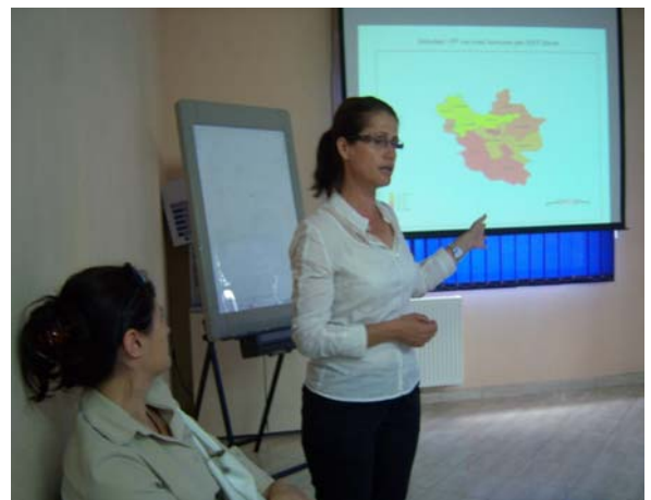
IPH LMIS manager presents LMIS performance analyses at the RH committee meeting

Over the course of the Regional Activity's work in Albania, three regular meetings of the RH Committee Chaired by the vice-minister were held. The Regional Activity presented contraceptive security issues, LMIS performance analysis and contraceptive financial sustainability research and other hot topics.