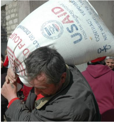
Humanitarian assistance provided by USAID.