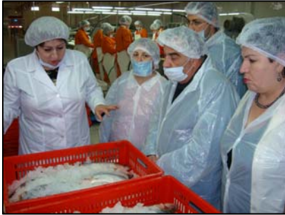
USAID-supported inspection trainings – such as this one at a seafood processing facility – aim to improve food safety and advance Azerbaijan’s World Trade Organization accession efforts.